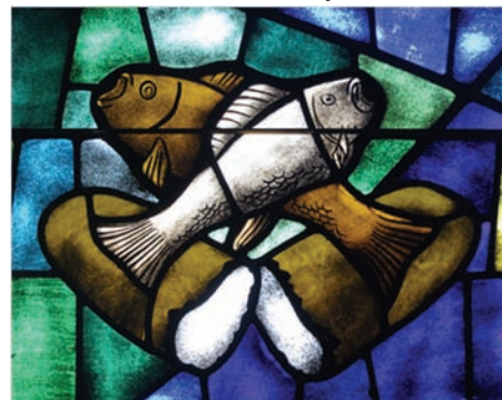
Loaves and Fishes

The church only has one bank account! All cheques must be payable to St. Joan of Arc Parish, and on the memo line write the fund it is to go towards such as ShareLife.